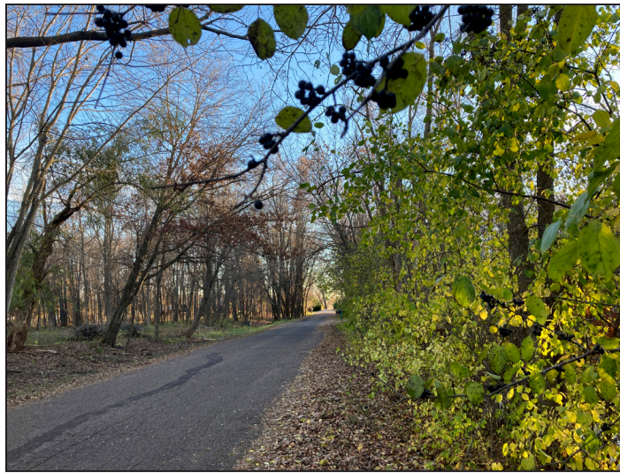
A road divides the cleared site and a buckthorn-infested woods.